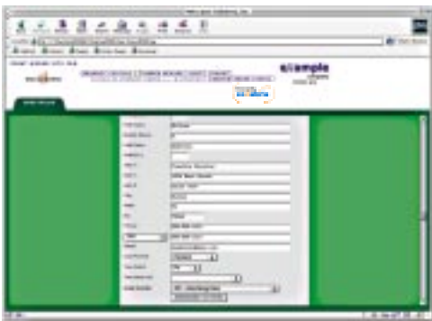
Your PrintCommerce eCatalog site creates a direct link to your preferred printing provider. Online ordering options include items with fixed content or customized documents with variable data.