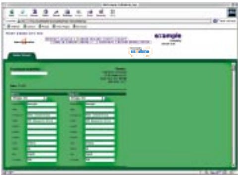
The eCatalog system provides complete tracking and reporting with real time access to print requisitions, purchase orders, and work-in-process. Sort by purchase order number, order date, cost center, or print item.