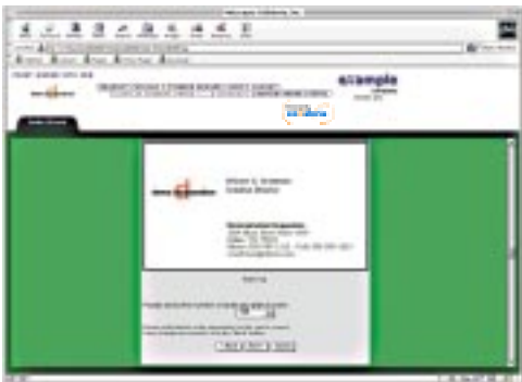
Online, soft proofs add to your options to help streamline production workflows.